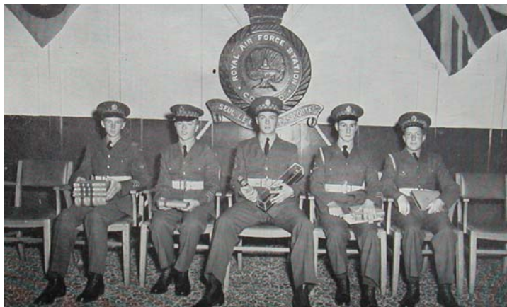
The Prize Winners